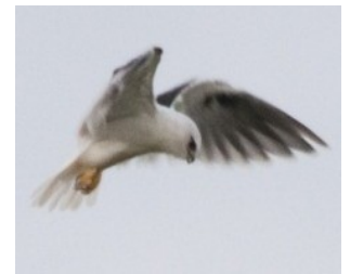
Black Shouldered Kite