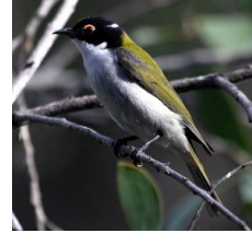
White napped honeyeater

This meandering reserve provides a scenic thoroughfare from the Bass Highway to Surf Parade with a link from the track to Glendale Court and a detour to Beach Avenue. Extensive tree planting under the aegis of the IRRA and the Society has provided habitat for wildlife, insects and frogs, with the wetland a draw for birdlife. Community planting and weeding days have resulted in a vibrant yet restful, park.