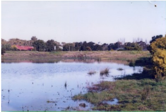
Ayr Creek before work commenced in 2004

Once an unpolluted creek draining the hills to the west of Inverloch and Anderson Inlet, the creek was used for cattle grazing and hence became full of weeds and degraded over many years.