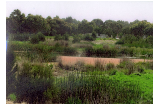
Ayr Creek today. walking bridge in background