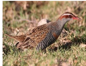
Buff banded rail

Volunteers from SG Conservation Society continue to weed and plant on a regular basis, together with Bass Coast Shire.